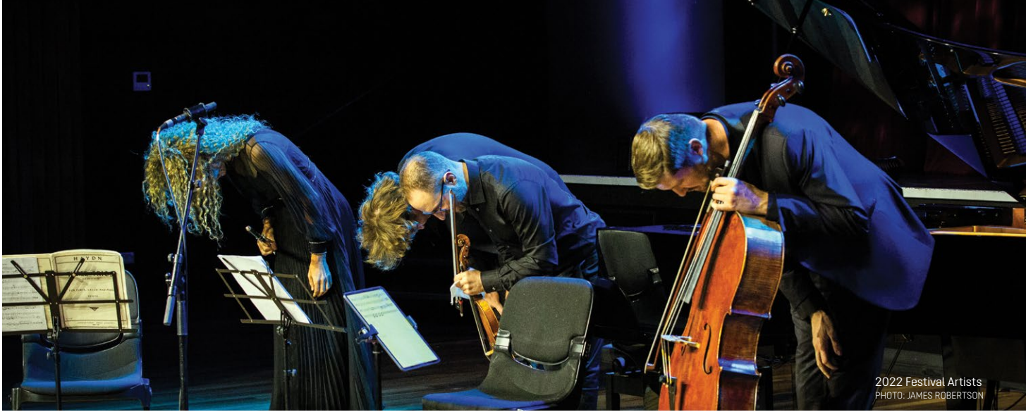
2022 Festival Artists

We wish to thank our many supporters that have helped to make this festival happen